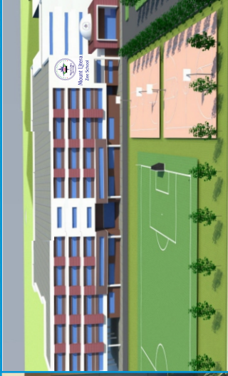
Mount Litera Zee School