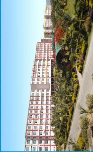
Index Medical College