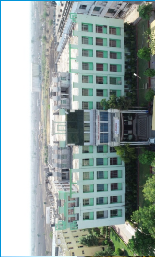
Index Institute of Dental Science