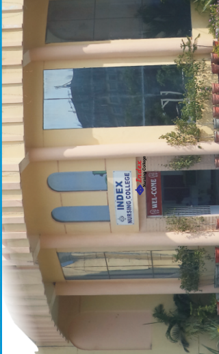
Index Nursing College